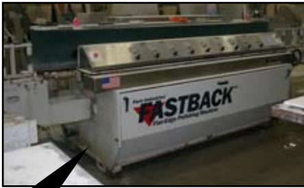
FLAT EDGE POLISHING MACHINE