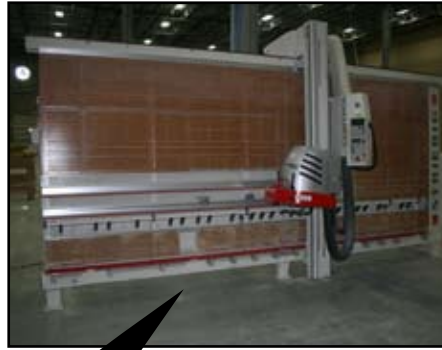
STRIEBIG VERTICAL PANEL SAW