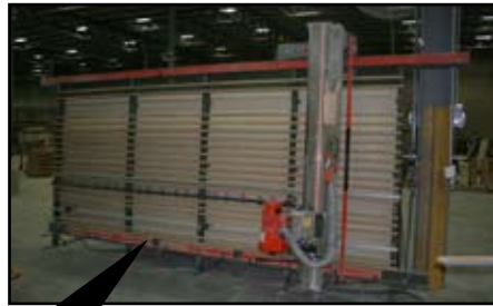
HOLZHER VERTICAL PANEL SAW

Owner: B Shea, Inc. in cooperation with Fifth Third Bank & Sovereign Bank