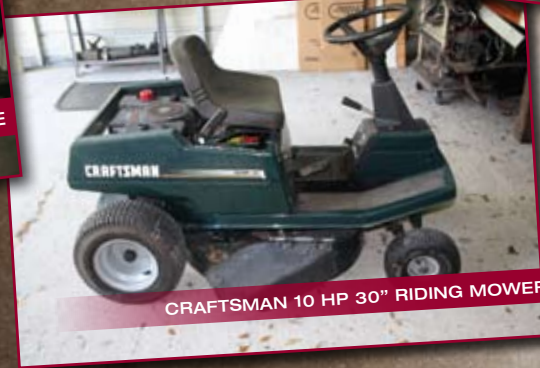
CRAFTSMAN 10 HP 30" RIDING MOWER

Estate Home and Contents Including: furniture, collectibles, appliances, electronics, tools and more.