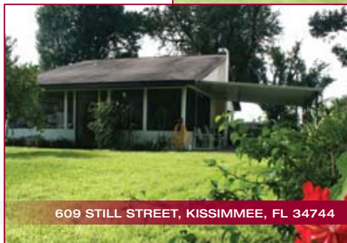
609 STILL STREET, KISSIMMEE, FL 34744