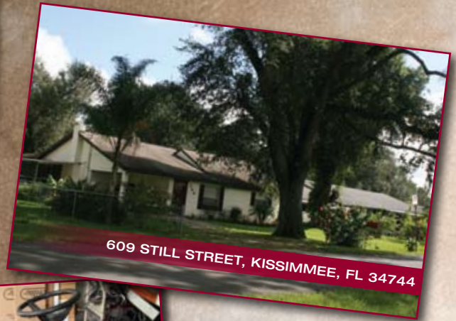
609 STILL STREET, KISSIMMEE, FL 34744