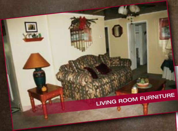
LIVING ROOM FURNITURE